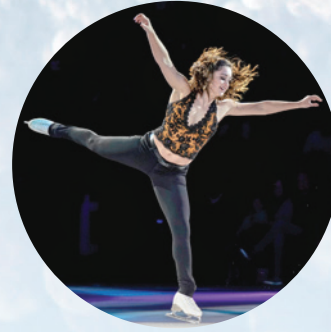
FIGURE 8 $25,000